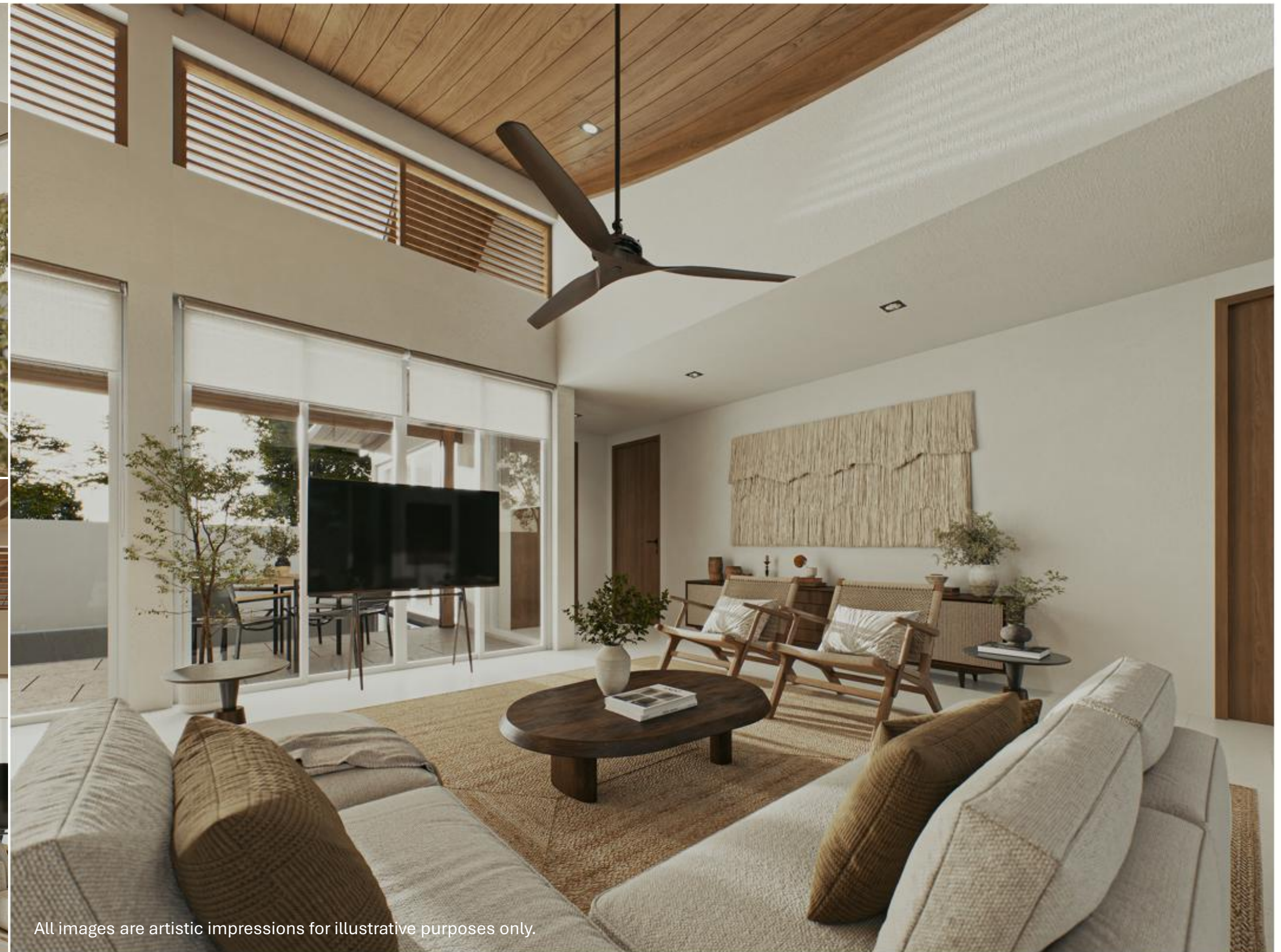
All images are artistic impressions for illustrative purposes only.