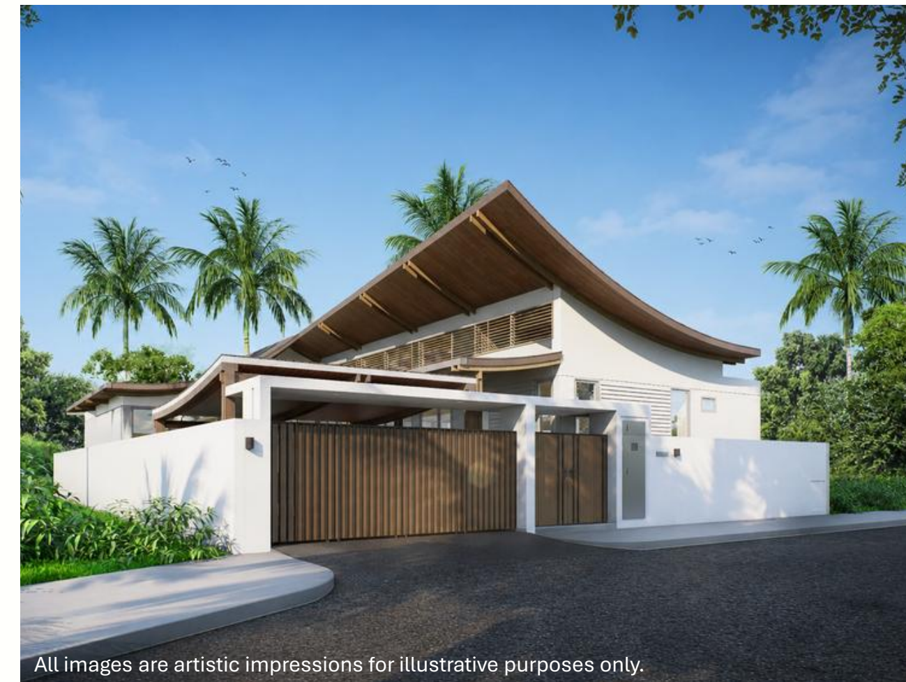
All images are artistic impressions for illustrative purposes only.

Set along the Hua Hin-Pranburi coastline, Pranaluxe “The New Chapter” offers a tranquil seaside retreat where modern tropical design blends effortlessly with timeless coastal charm.